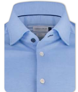
500 SKY BLUE