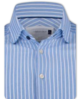
550 SKY BLUE STRIPE

It has the look of a classic woven dress shirt, but is in fact a knitted shirt. Combining the best of two worlds. This is the world's most comfortable good looking dress shirt. Feels like a t-shirt, styled like a Wall Street Wolf.