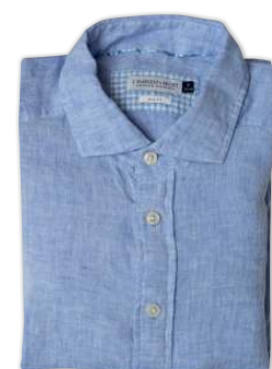
500 SKY BLUE

Summer in a shirt. Tropical colors, authentic, characteristic wrinkling texture, casual, refined, vacation. All words describing our classical airy open weaved 100% linen shirt. The only shirt that deserves to be wrinkled and looks better this way.