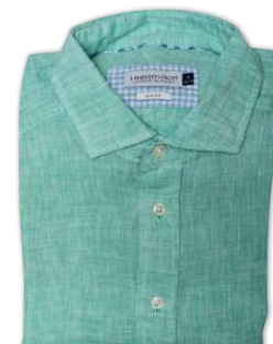
500 SKY BLUE