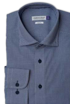
616 NAVY CHECK

4-way stretch fabric with NON IRON treatment is another new and innovative performance made by us. With a 360 degree stretch ability, the shirt is as comfortable as a woven dress-shirt can get. It works with you in your every movement.