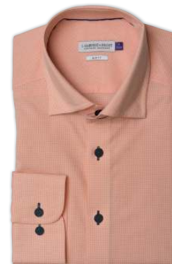
313 ORANGE CHECK