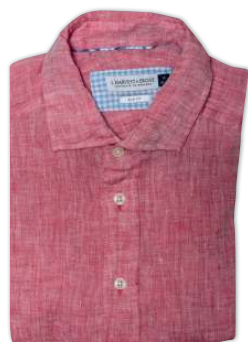
500 SKY BLUE