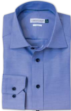
560 MID BLUE