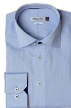
500 SKY BLUE