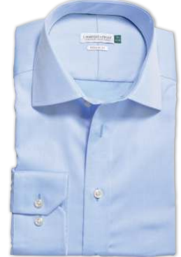
500 SKY BLUE